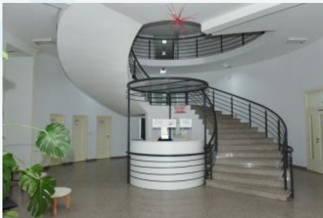
Student's Welcome Desk

University has its own modernly equipped student dormitory 1.5 km away from the center of the town